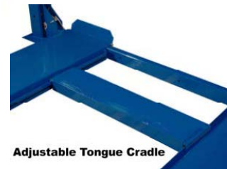
Adjustable Tongue Cradle