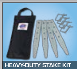
HEAVY-DUTY STAKE KIT