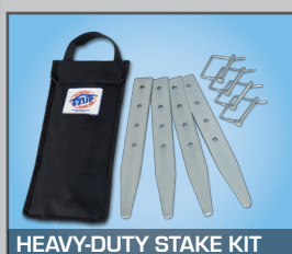
HEAVY-DUTY STAKE KIT