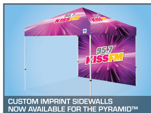
CUSTOM IMPRINT SIDEWALLS NOW AVAILABLE FOR THE PYRAMID™