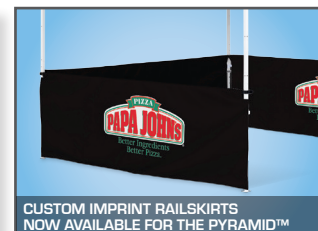
CUSTOM IMPRINT RAILSKIRTS NOW AVAILABLE FOR THE PYRAMID™

International E-Z UP, Inc. 1900 Second Street Norco, California 92860 (951) 279-0999 • FAX (800) 810-8775