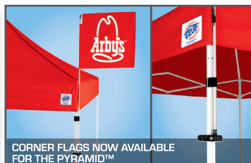
CORNER FLAGS NOW AVAILABLE FOR THE PYRAMID™