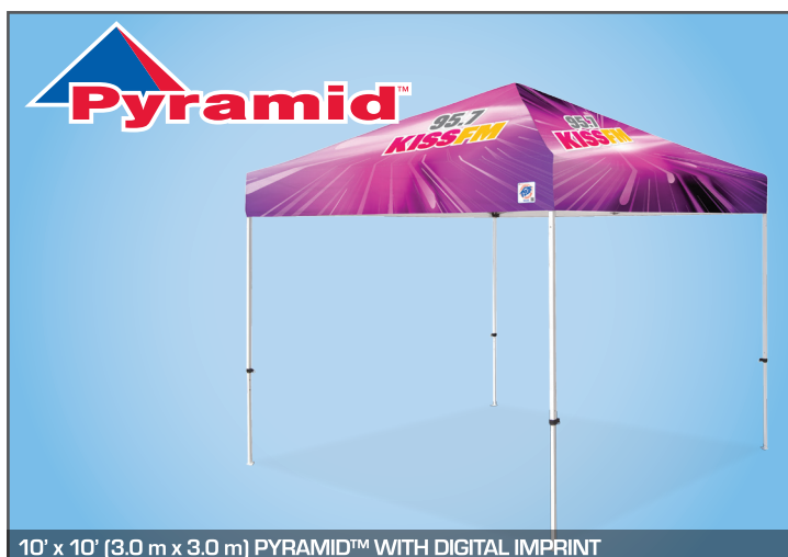
10' x 10' (3.0 m x 3.0 m) PYRAMID™ WITH DIGITAL IMPRINT

New product upgrades and enhanced features to the Pyramid™ shelter make a great product even better! The Improved Pyramid™ shelter is now easier to open and includes an extended warranty. Its 10' x 10' (3.0m x 3.0m) clear span center design offers great headroom for all groups. E-Z UP® Custom Imprint Sidewalls, Railskirts and ProFlag™ Accessories can be easily attached directly to the shelter frame for an instant visual impact. New Digital imprint customization options allow the Pyramid™ to feature high-quality, photo like imagery to draw attention in any setting.