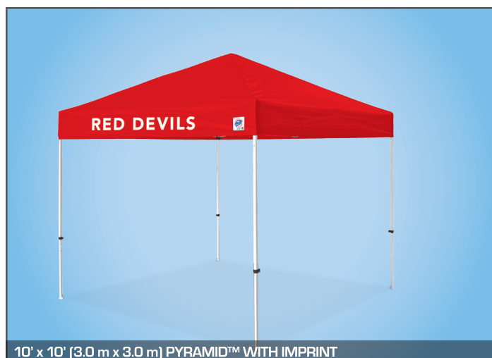
10' x 10' (3.0 m x 3.0 m) PYRAMID™ WITH IMPRINT

Personal Use Grand Opening Backyard Barbecues Bake Sales Light Beach Use School Use Construction Outdoor Events Elections Organizations Hospital/Medical Kids' Sports Games Community Events Camping Shade Fairs/Festivals Commercial Use Government Use Bulk Promotions