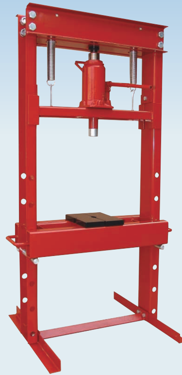
P20T 20 Ton Shop press

Sits in the corner and does the job. Sliding 20 ton bottle jack and moveable table height can install or remove bearings and bushings safely and quickly.