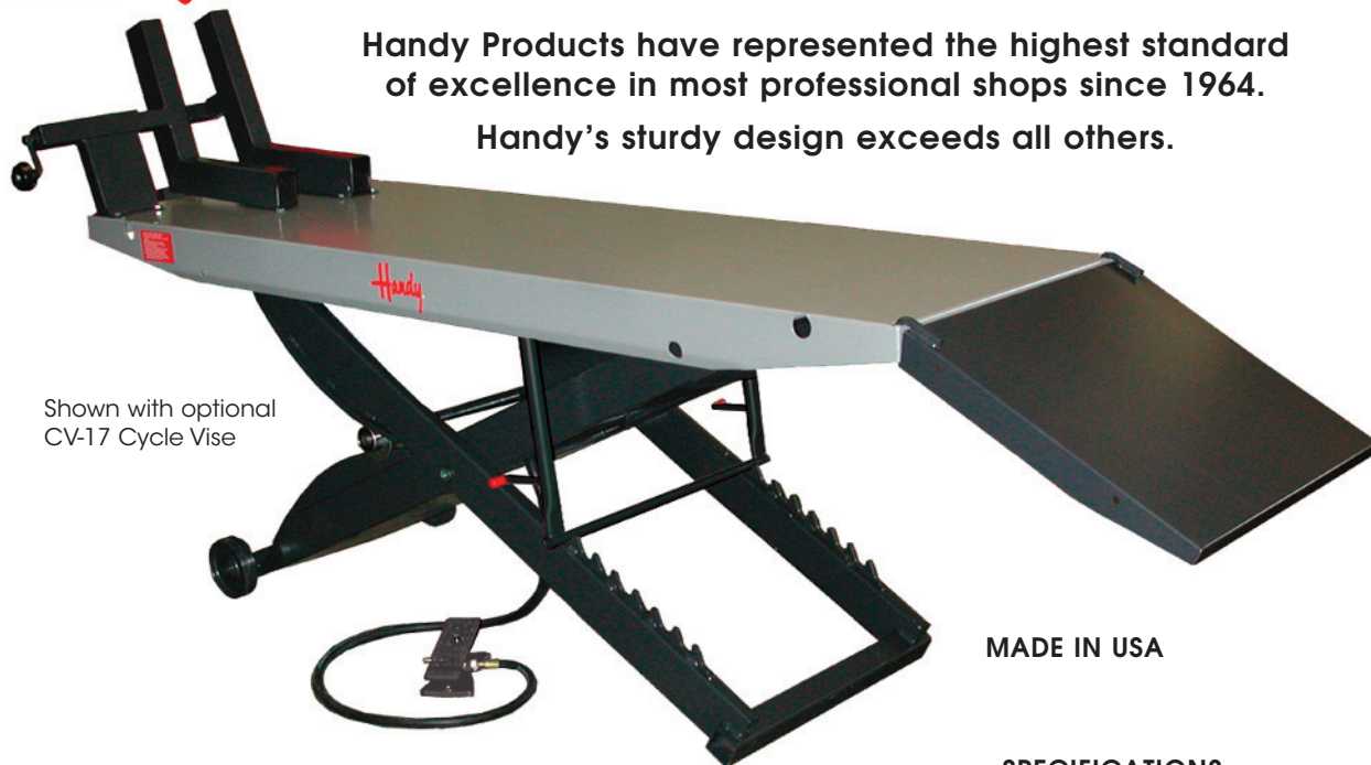
Shown with optional CV-17 Cycle Vise

Handy's sturdy design exceeds all others.