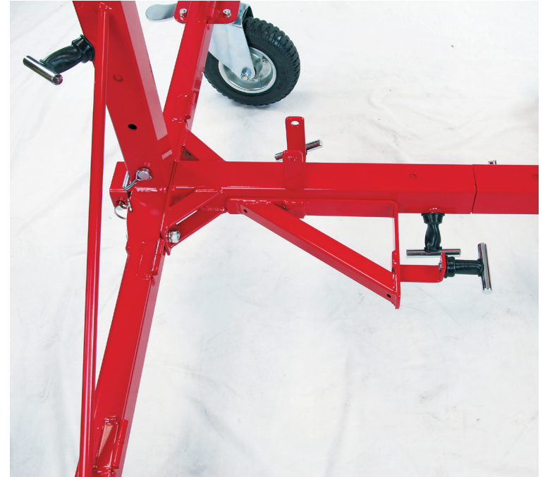
Shows where to store Quick Release Support Bracket when Truck Bed Dolly is in collapsed position.