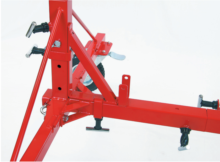
Shows position of the Quick Release Support Brackets when Truck Bed Dolly is in use. Note: make sure all T-bolts are tight.