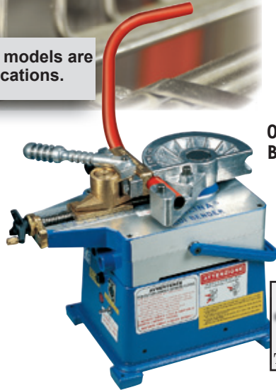
070 Medi Bender