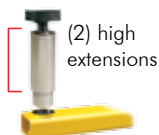
(2) high extensions