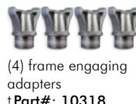
(4) frame engaging adapters † Part#: 10318