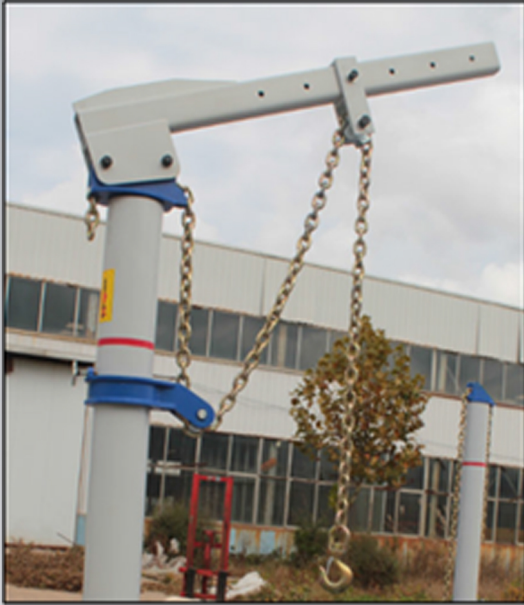
OH Boom Pull Tower Extension