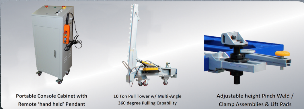
Portable Console Cabinet with Remote 'hand held' Pendant