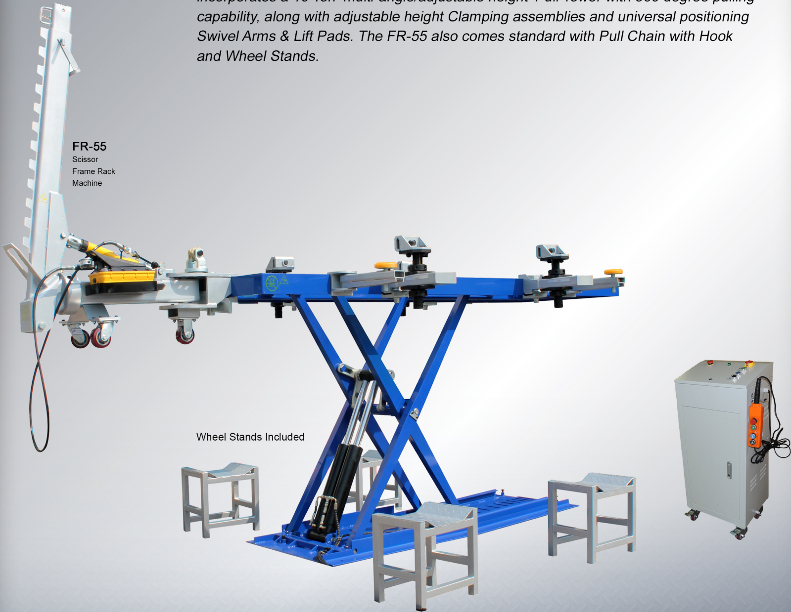
FR-55 Scissor Frame Rack Machine

The FR-55 Scissor Lift & Frame Rack is a unique, high quality, compact frame straightening machine with the versatility of an automotive lift, designed to service Full-frame or Uni-body type vehicles with its 5,500 lb. lifting capacity. The FR-55 incorporates a 10 Ton 'multi-angle/adjustable height' Pull Tower with 360 degree pulling capability, along with adjustable height Clamping assemblies and universal positioning Swivel Arms & Lift Pads. The FR-55 also comes standard with Pull Chain with Hook and Wheel Stands.