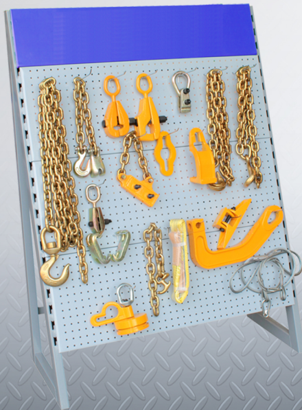
FR-55-TBK20 Tool Board, Tool and Clamp Kit Sold Separately