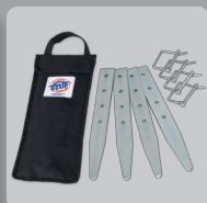
Deluxe Stake Kit