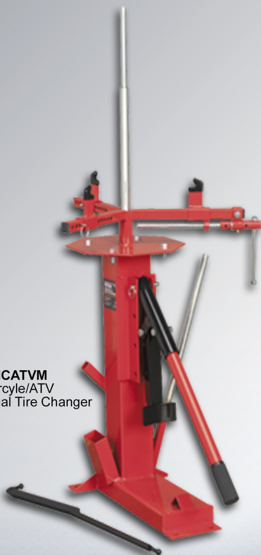
TC-MCATVM Motorcycle/ATV Manual Tire Changer

The TC-MCATVM 'mini' Motorcycle and ATV Manual Tire Changer is suitable for a wide variety of tires and wheels, including go-karts and golf carts. Designed to work on bearing or hub centered wheels, standard two sizes of center posts, and manual bead breaker combined with durable, heavy duty construction is the perfect tire changer for hobbyists to small and large service repair shops.