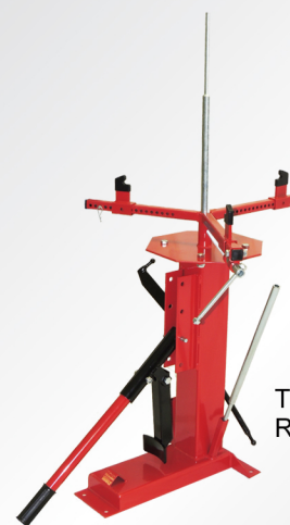
TC-MCATVM Right View