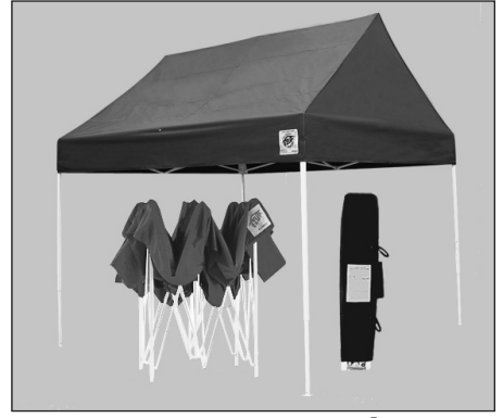
"Sets Up in Seconds!"™