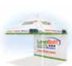
CUSTOM PRINTED SIDEWALLS