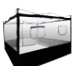
FOOD BOOTH WALLS