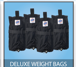
DELUXE WEIGHT BAGS