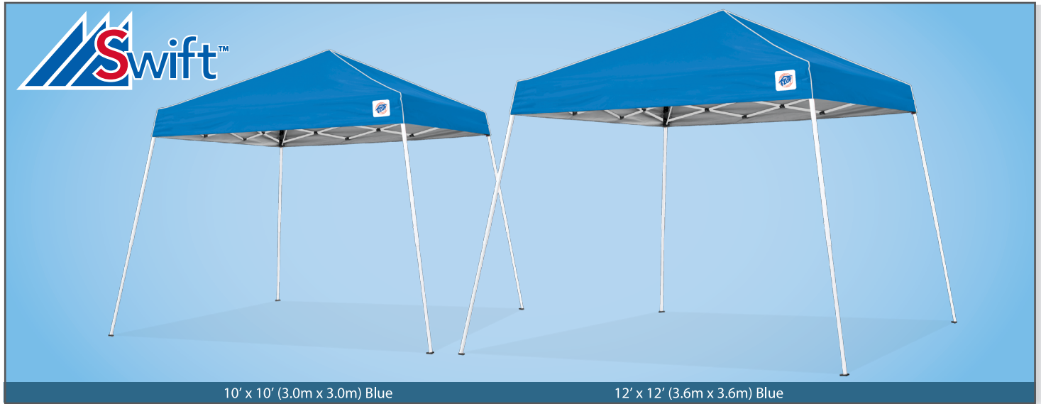
10' x 10' (3.0m x 3.0m) Blue

The Swift™ is a lightweight recreational shelter able to take anywhere. Ideal for recreation, sporting events, picnics and backyards, enjoy the sunlight in the shade at any event and guarantee blocking 99% of harmful UV rays while enjoying the outdoors.