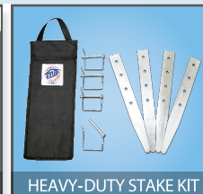
HEAVY-DUTY STAKE KIT