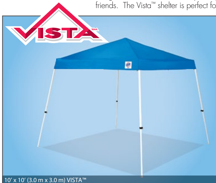
10' x 10' (3.0 m x 3.0 m) VISTA™

The Vista™ Instant Shelter® is a lightweight recreational shelter that's packed with new upgraded features that make it stronger and easier to open. The UV resistant top offers better protection from the sun. The slanted leg design allows for added stability. Bring it to all your recreational events and provide shade for you and all your friends. The Vista™ shelter is perfect for sporting events, backyards, picnics, parties or relaxing on the beach.