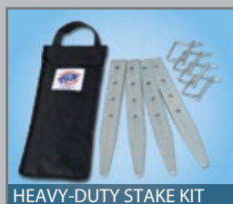
HEAVY-DUTY STAKE KIT