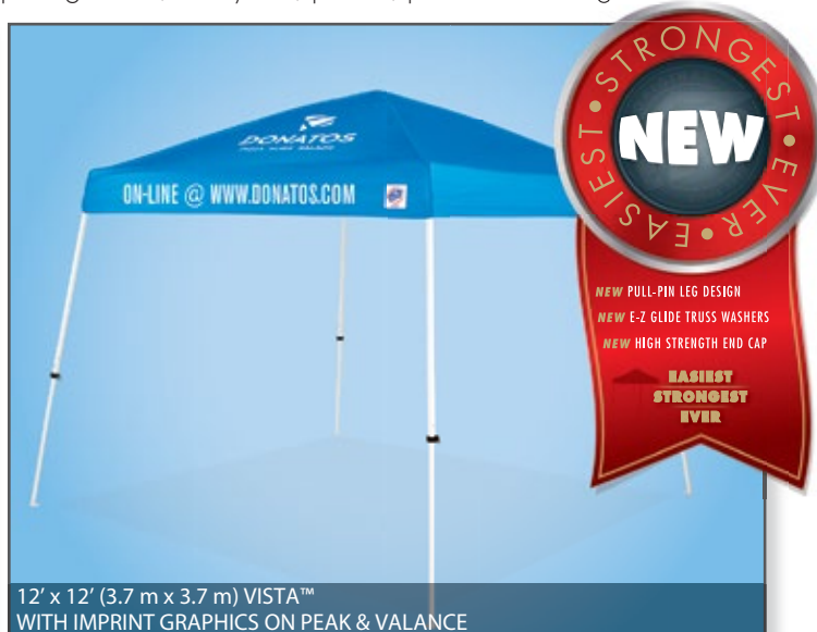
12' x 12' (3.7 m x 3.7 m) VISTA™ WITH IMPRINT GRAPHICS ON PEAK & VALANCE