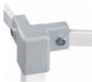
High Strength End Cap for Greater Durability

Standing out at any events, street fairs or swap meets is easier than ever with the E-Z UP® Vantage™ Instant Shelter®. Upgraded with new cool grey components that combines style with extra strength and support for multiple uses makes this shelter especially enticing for recreational marketers. For extra attention, add full bleed, photo quality digital graphics to reinforce your message and leave a lasting professional impression! E-Z UP® Railskirts and ProFlag™ Accessories can be easily attached directly to the shelter frame for an upgraded instant visual impact.