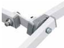
E-Z Glide Truss Washers Allow for Increased Stability