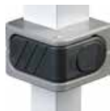
Toggle Leg Adjustment System