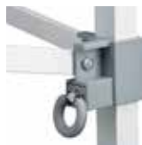
Pull Pin Slider for E-Z Quick Lock and Release