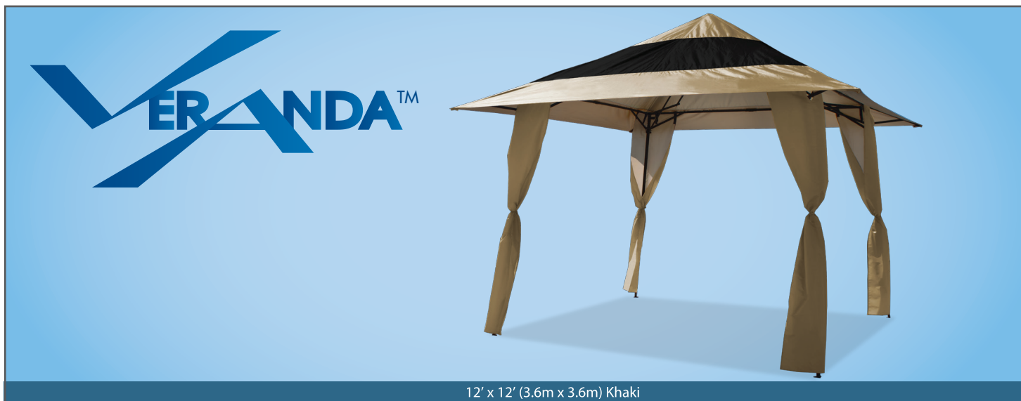
12' x 12' (3.6m x 3.6m) Khaki

The Veranda™ recreational shelter is an affordable shelter with a sleek style to complement any yard. Earth-tone brown colors with matching leg skirts bring an indoor experience to the outdoors. Lounge beneath this shelter escaping the sun and enjoying time with friends and family.