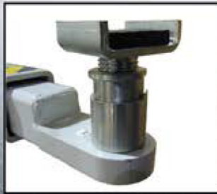
Diagram / Specs